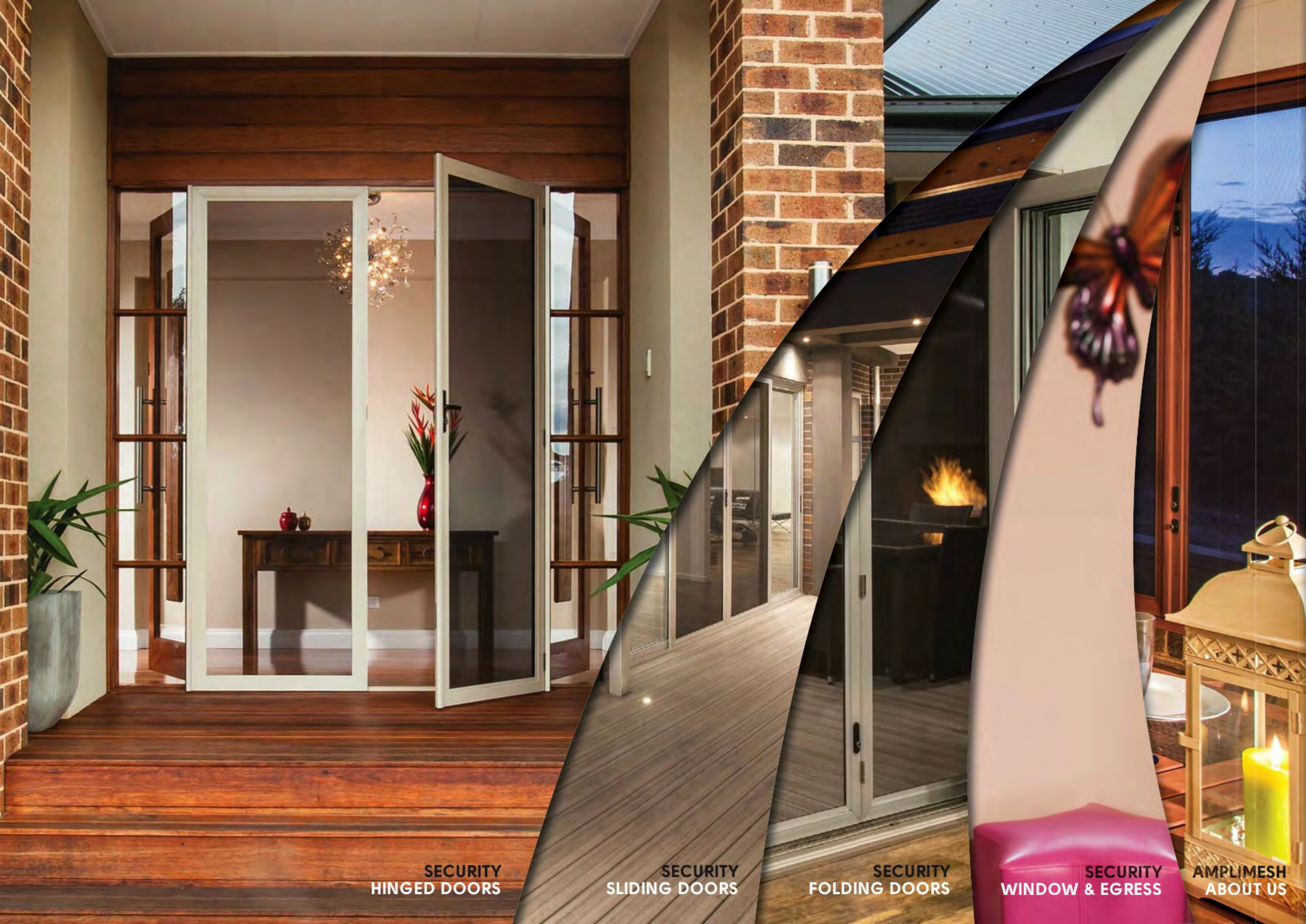
SECURITY HINGED DOORS