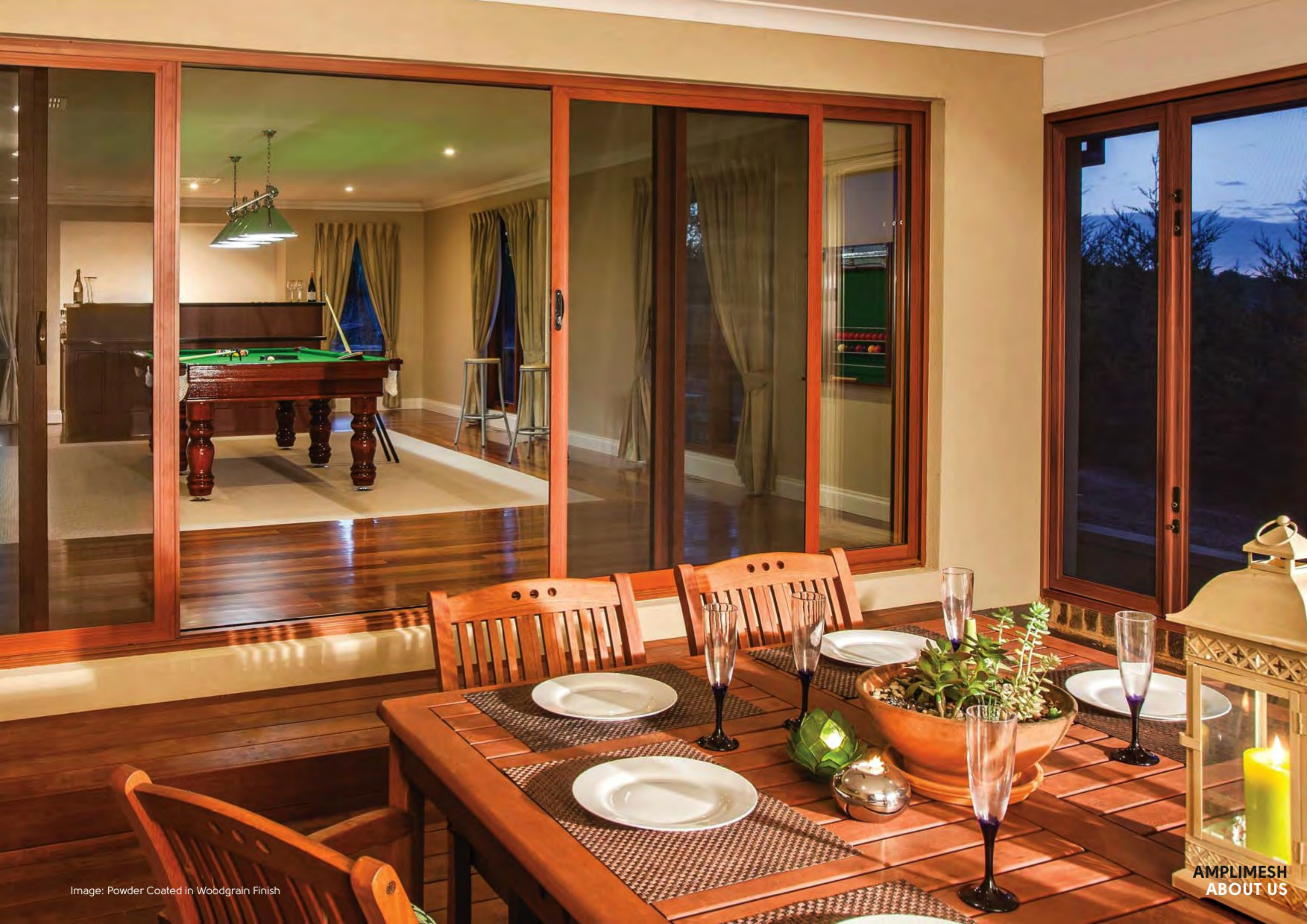
Image: Powder Coated in Woodgrain Finish